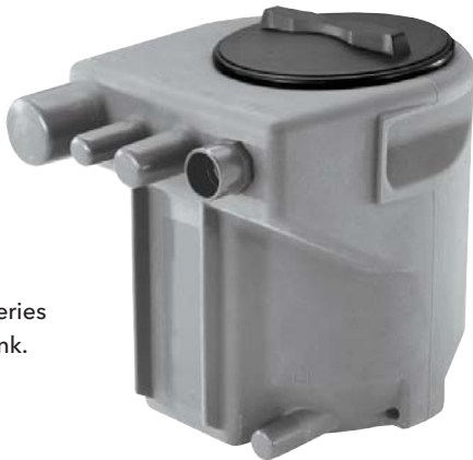
Micro 4 Series 80 litre tank.

MICRO 4 Series Prefabricated lifting station for clean and grey water according to EN 12050-2 standard.