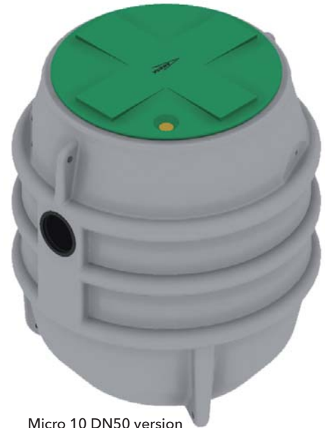
Micro 10 DN50 version Tank Height 1300mm Tank Diameter 1100mm 1200 litre tank.