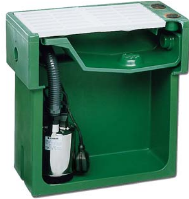
Minibox Series 85 litre tank.