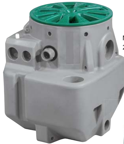
Micro 6 Series 270 litre tank.