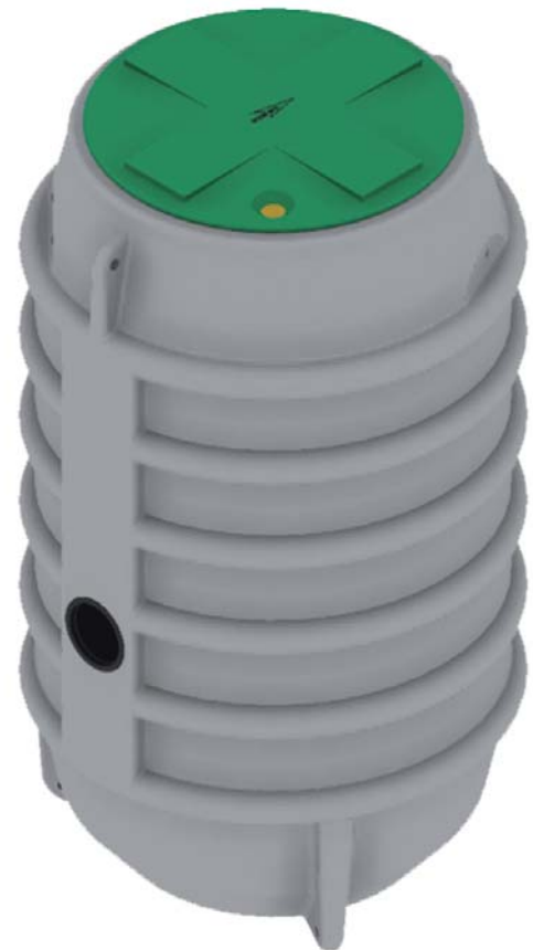
Micro 10 DN50 & DN65 version Tank Height 2000mm Tank Diameter 1100mm 1900 litre tank.