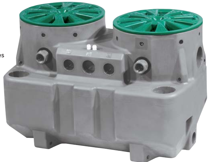
Micro 6+6 Series 550 litre tank.